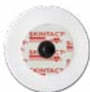
F-50C / FS-50C F-601C / FS-601C