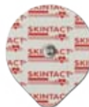
F-TF /6 FS-TF /6