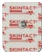
F-RG /6 F-RG1 /6 FS-RG /6 FS-RG1 /10