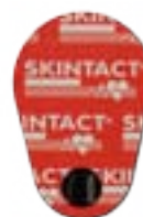
4 mm Banana Adaptor