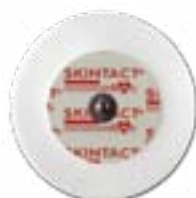
Standard / En- hanced Foam