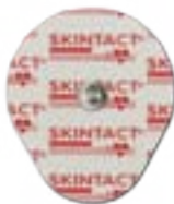
F-TC1 /6 FS-TC1 /10